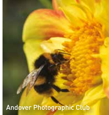
Andover Photographic Club