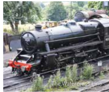
The Watercress Line