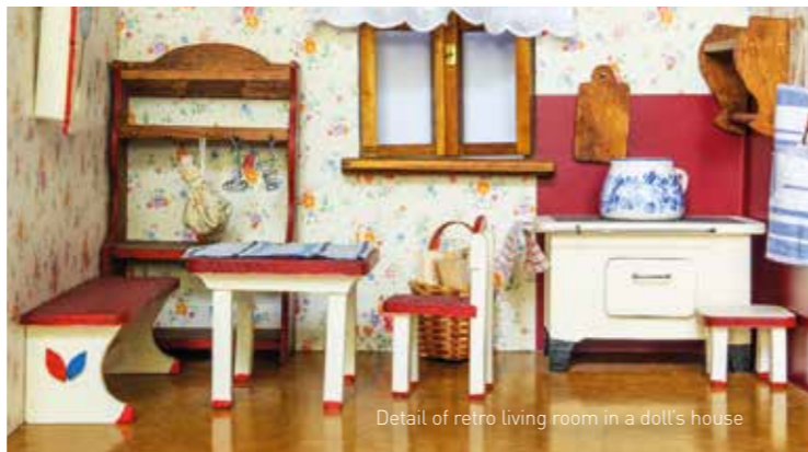
Detail of retro living room in a doll's house