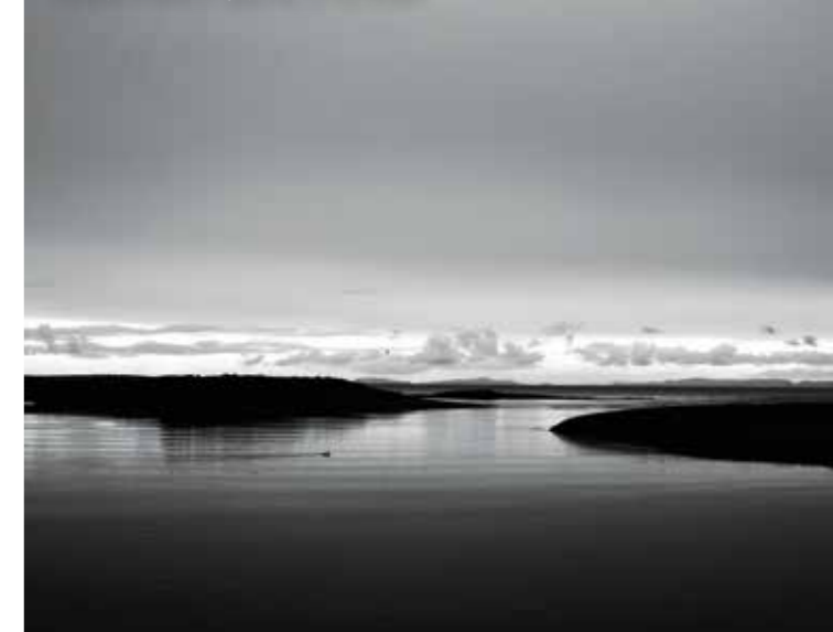
A Study of Nature: Spey Bay