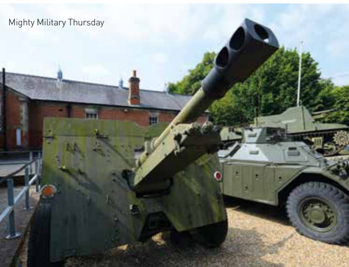
Mighty Military Thursday

Cost: included in admission charge, donations welcome