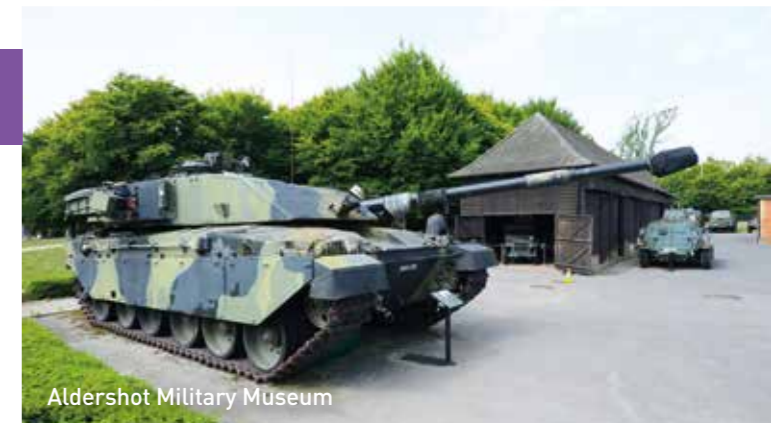
Aldershot Military Museum

FIND OUT MORE AT: www.hampshireculturaltrust.org.uk